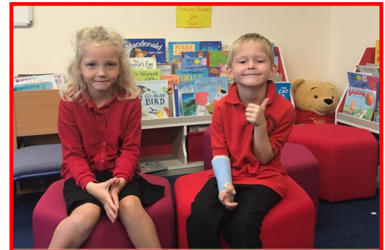
Reception—to be appointed shortly.

Our School Councillors have been elected via democratic vote, and they held our first meeting was held last week when the children shared the ideas that their class members had suggestions: